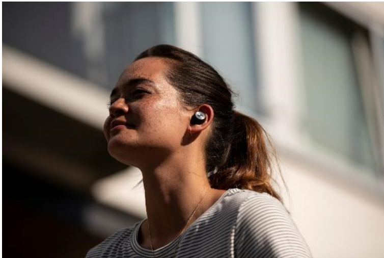
Sennheiser's MOMENTUM True Wireless earphones set new standards in true wireless audio.

Visitors to the Sennheiser booth can also get hands on with another exciting new product - the MOMENTUM True Wireless, which is making its CES debut.